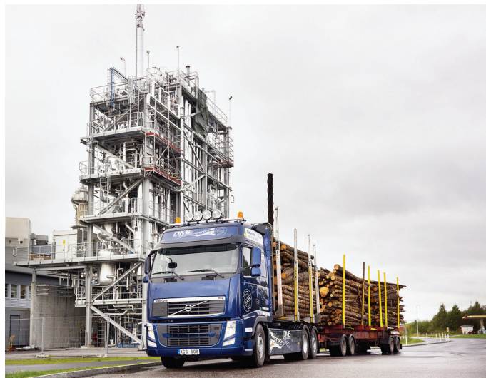
BioDME plant with DME log truck in foreground

DME can also be converted itself into olefins and synthetic hydrocarbons.